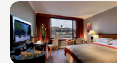
InterContinental Budapest ***** Rooms from 125 €