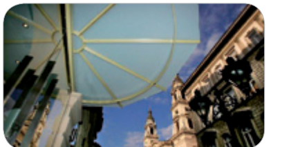
Hotel Central Basilica *** Rooms from 70 €

All prices include breakfast and taxes. The hotels are in close vicinity of the conference venue, except Hotel Gellért where one has to count on a walk/travel of about 20 minutes.