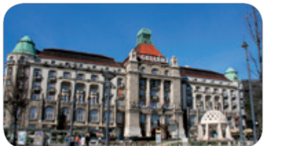
Danubius Hotel Gellért **** Rooms from 76 €