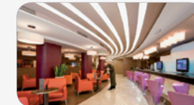
Mercure Budapest City Centre **** Rooms from 105 €