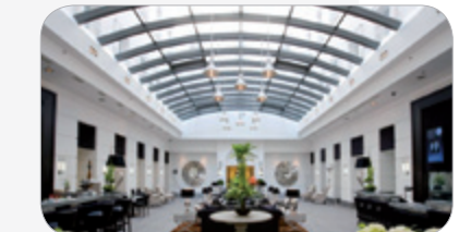
Alta Moda Fashion Hotel **** Rooms from 79 €